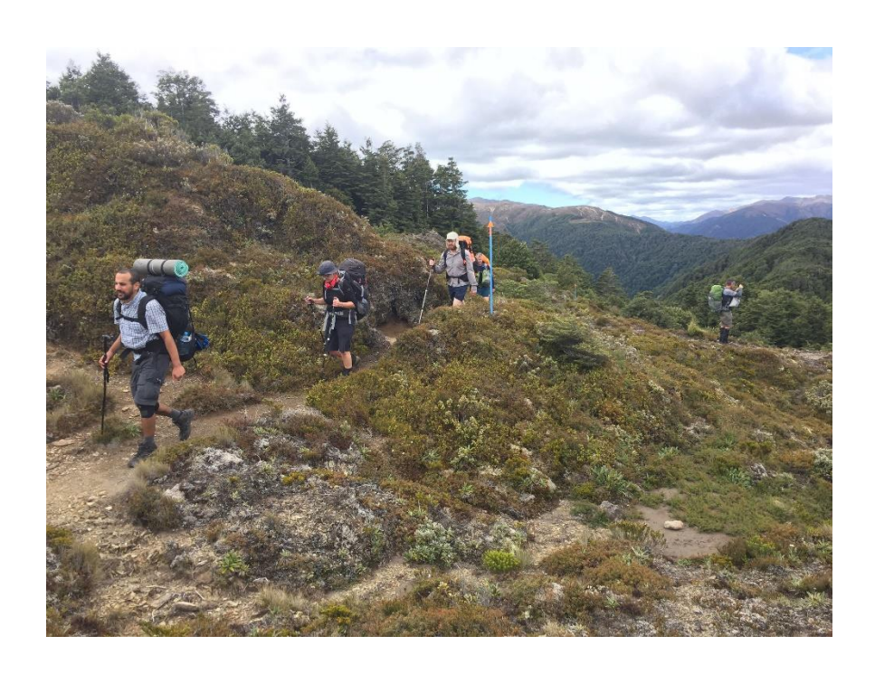
Trip 2919B Kaimanawas