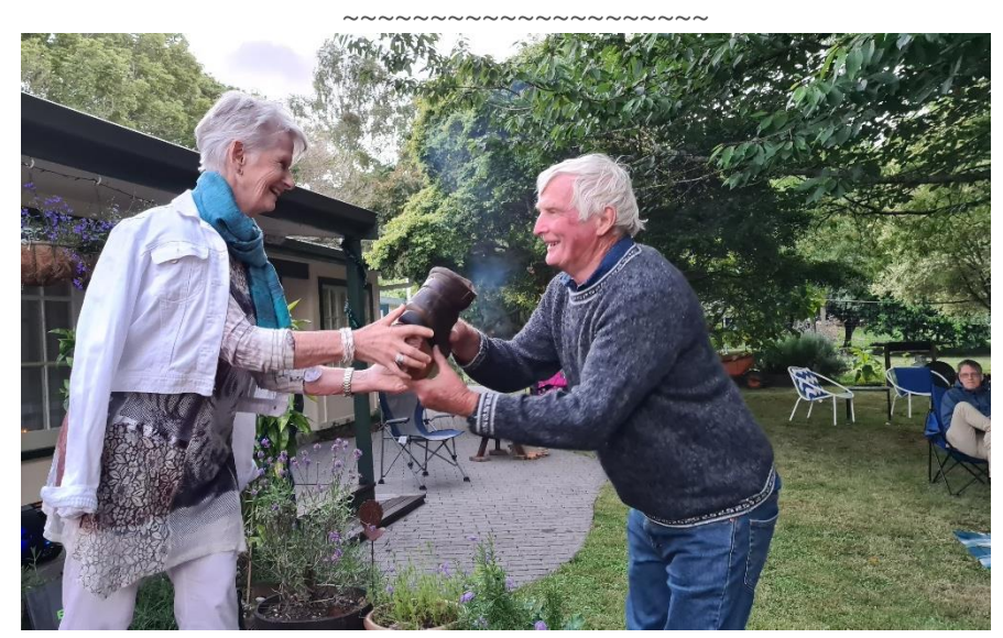
Passing the buck... oops boot at the Christmas party