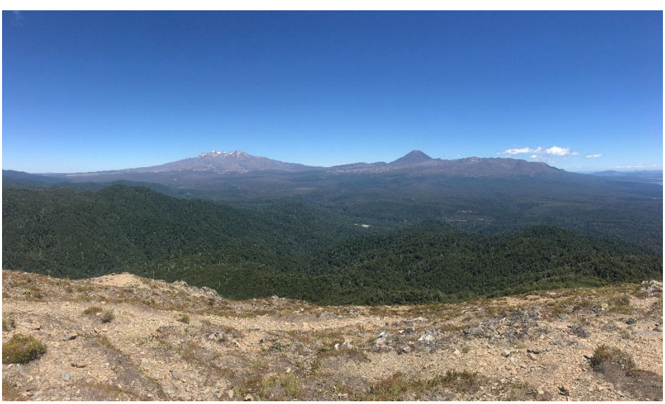
View from the Urchin track

We have liftoff