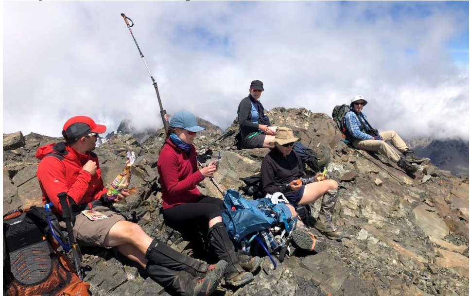
On the top of Tapuae o Uenuku