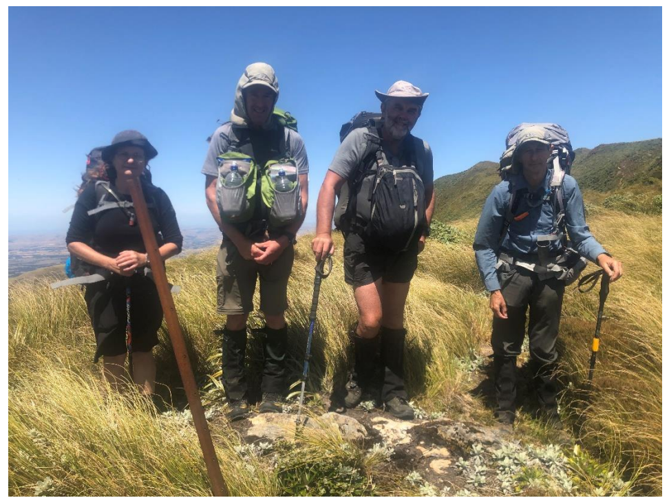
Near Longview Hut