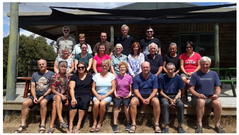
Trip leaders attendees