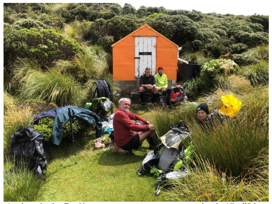
A welcome break at Tarn bivvy