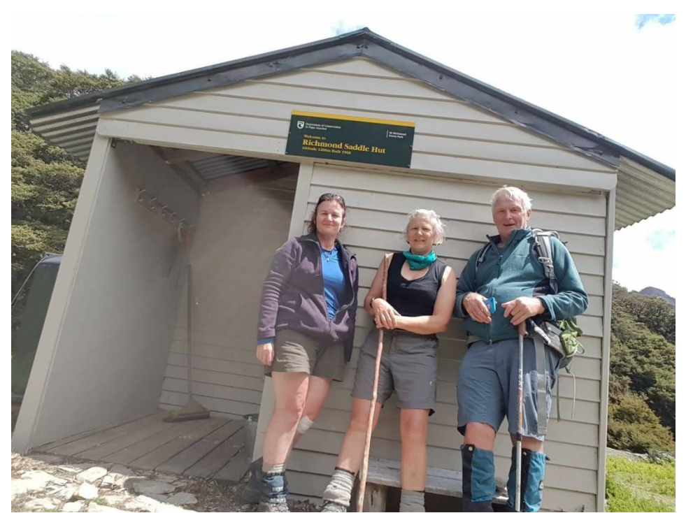
The team at Richmond Saddle Hut