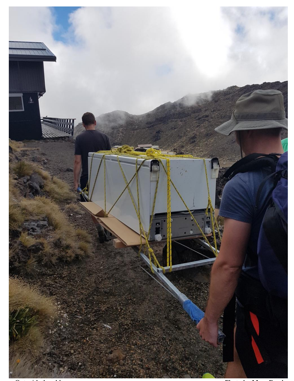
Out with the old....