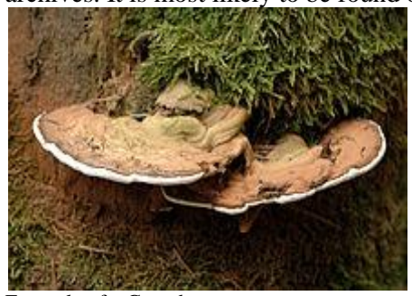
Example of a Ganoderma

➤ WANTED: When you are in the bush lots of you are fascinated by the many Ganoderma fungi – those bracket fungi you see on dead trees. Well, it seems there is a rare unnamed one on Mt. Pirongia or in the Awaroa valley and only 3 specimens exist in the archives. It is most likely to be found on Pukatea trees.