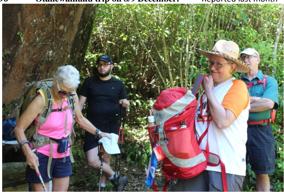
Time to get moving

Trip 2796 Otanewainuku trip on 8/9 December. Reported last month