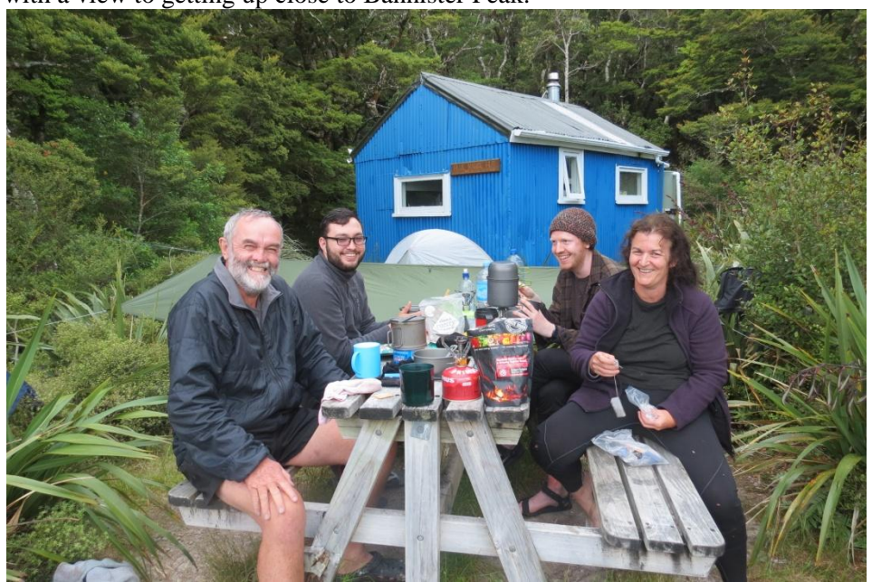
The table at Blue Range Hut

with a view to getting up close to Bannister Peak.