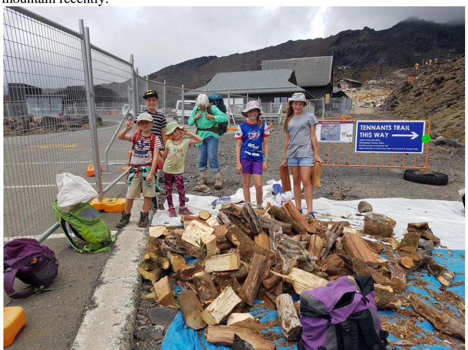
Nearly finished – a sterling job by our younger members

We had a busy working party a few weeks ago, carrying up the firewood, doing some painting, and cleaning and generally getting the place looking more spick and span. Don't forget all ages can do it as you can see from the picture below, all the kids carrying the firewood to keep us warm in winter, and a new sofa was carried up, and the old fridge down. We also saw the work for the new gondola taking shape - there are some concrete pads in, earthworks going on and hopefully the poles soon. It will be exciting to see and travel in the new 10 person gondola up the mountain. Looking forward to winter, which, despite all the great weather, will be coming. In fact, there was snow on the top of the mountain recently.