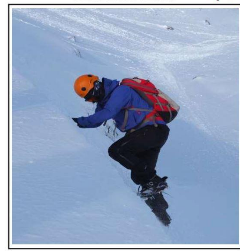
Member of: Federated Mountain Clubs of New Zealand Inc Ruspelliu Mountain Clubs Association