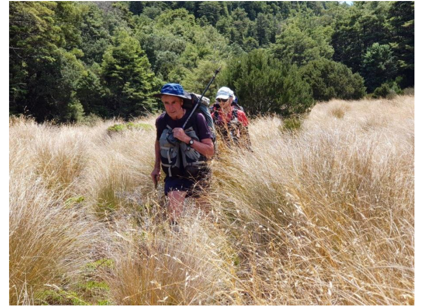
Through the riverside tussocks