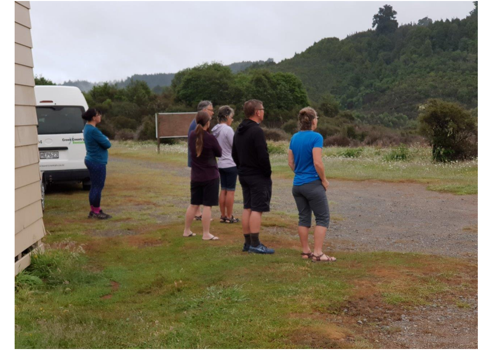
Listening to the dawn chorus