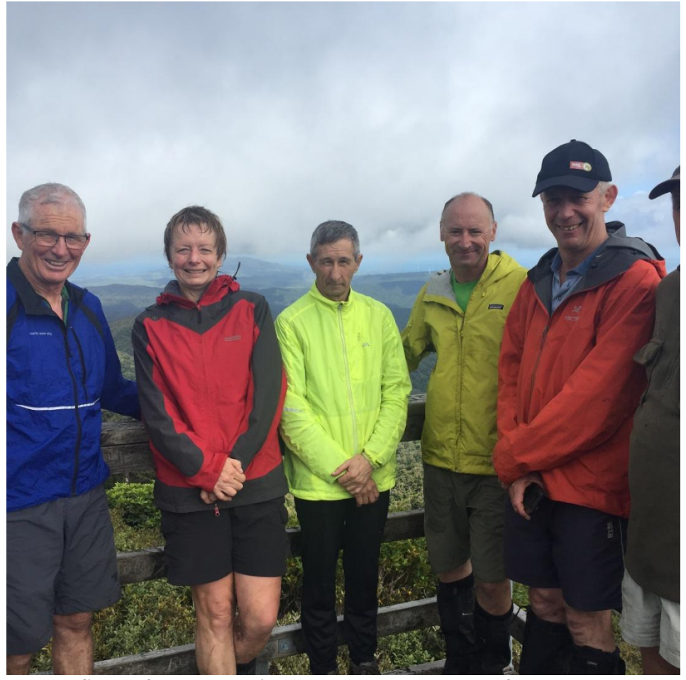
Some of the Mountain Madness team – story to follow soon