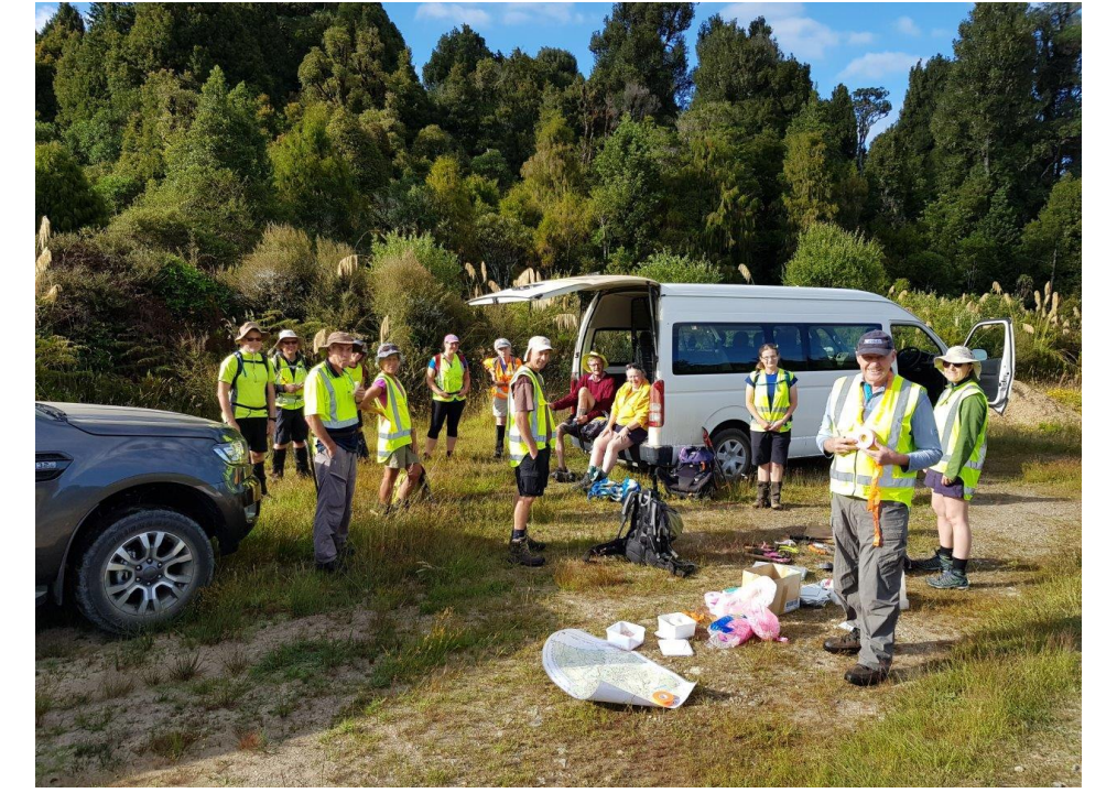
Ready to head off into the field