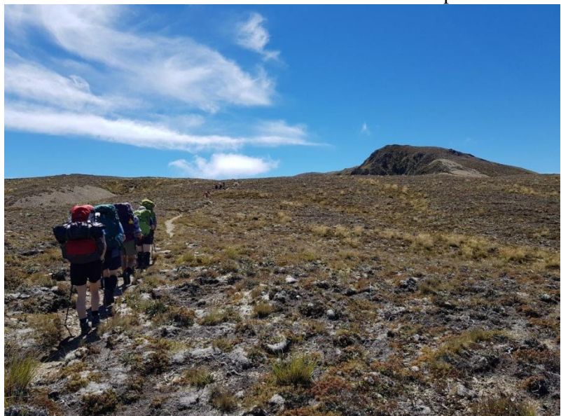
Up to Umakarikari peak

We were packed up and ready to leave by 8am the next morning and Dianne kindly dropped us off at the start of the Umakarikari track where we departed around 8.30am.