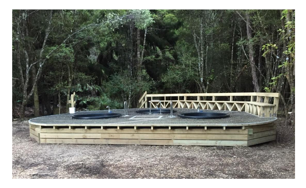
Te Puia Springs tubs – beautifully revamped