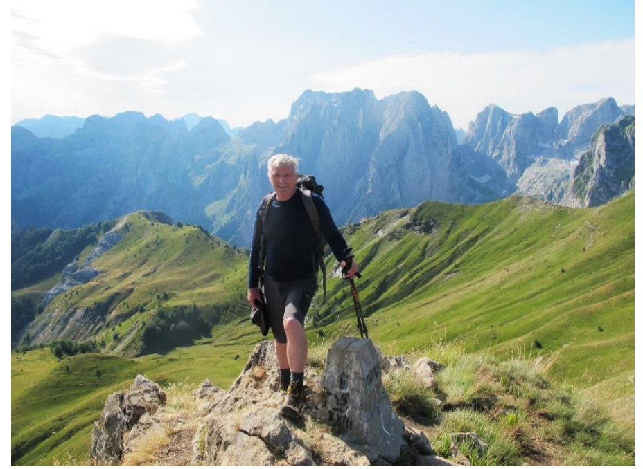
Atop the Balkan slopes

Property Office". This time it initially upset my plans for the Bulgarian Mountains. I couldn't do the 2-day climb of Vihren Peak (second highest in Bulgaria) as a result. Not to worry as Sofia is a really nice place to visit and being close to the cafe scene there was plenty to see and do. Ultimately, I did climb Bulgaria's highest peak, Musala (2925 metres)- also the