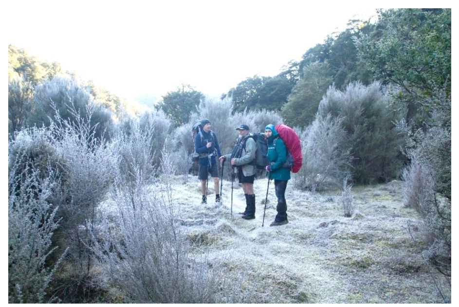
Look how freezing this really is