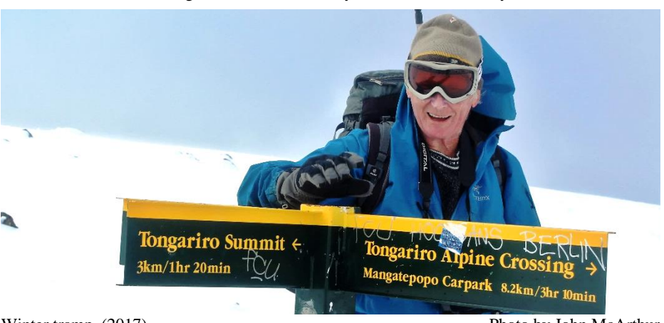
Winter tramp (2017)