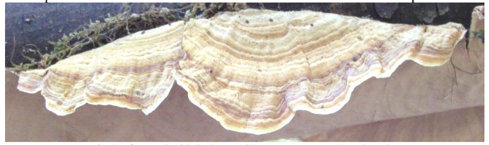
Trametes versicolor fungus in Okahukura valley

➤ Hump Ridge Track to be newest Great Walk. Minister of Conservation Eugenie Sage has announced the newest addition to the Great Walk network. DoC will now work with the Tuatapere Hump Ridge Trust to bring the walk up to Great Walk standard and change it from its' current 2night walk to a 3night experience. Approximately $5m of funding is dedicated to the upgrade. The new Great Walk will be set to open in late 2022 after track upgrades are complete. FMC will keep a watchful eye to ensure the use of Port Craig Schoolhouse to the South Coast Track and beyond are not compromised, and commercial development associated with the tracks' new Great Walk status is kept in check.