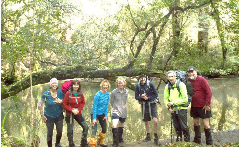
The team of winter enthusiasts