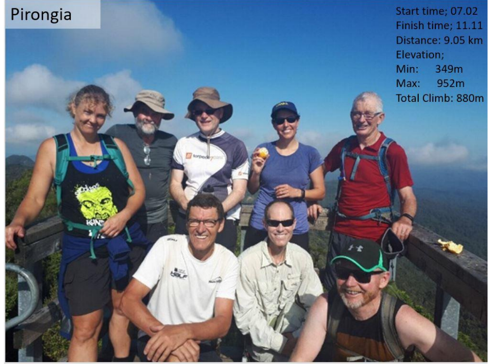
....from the DoC website....

One of the world's greatest cross-globe migrations is well underway with the arrival of bar-tailed godwits/kuaka to Southland coastlines. Every spring, around 75,000 of these half kilogram, brown-grey, long-beaked shore birds fly approximately 12,000km from Alaska and the Arctic to New Zealand, with around 4000 of them landing on Southern coastal areas.