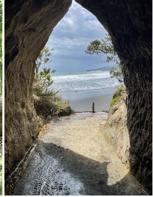
Waikawau tunnel