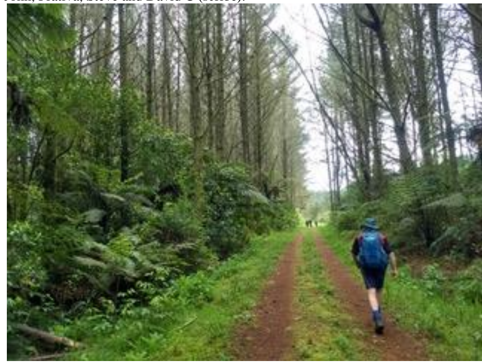
Along the trail

The pleasant prospect of a walk alongside the Waikato River in good company lead to my booking for this trip. The tramp was a 11km section of the Waikato River Trails from Waipapa Dam to the Mangarewa Suspension Bridge and return, a total of 22km. Parking the van at the Waipapa Reserve layby enabled the group of 13 trampers to walk over the Waipapa Dam to the start of the track. The powerhouse is a fine example of 1960s architecture and the sound of rotating turbines leaves an impression. The wide track was conducive to conversation and took us through regenerating native bush with beautiful views of the Waikato River. It took us three hours to reach the Mangarewa Suspension Bridge, 80 metres long and sitting an impressive 42 metres above the Mangarewa Stream. Built in 2011, the bridge is the longest and highest on the Waikato River trails. this was a convenient place for a lunch stop; a picnic table in the sun. Ron delved into the bottom of his pack and retrieved a cake tin with Jacqui's lovely home baking. A buttery slice made with oats and coconut was enjoyed by everyone. The thunder rolled in for the return walk but fortunately the rain held off until the trip home in the van. Overall, this was an enjoyable day out; a special thanks to Ron (leader and driver). The participants were David S, Jeanette, Kathy, Fiona, Lynette, Beatrix, Marion, Jim, John, Prativa, Steve and David C (scribe).