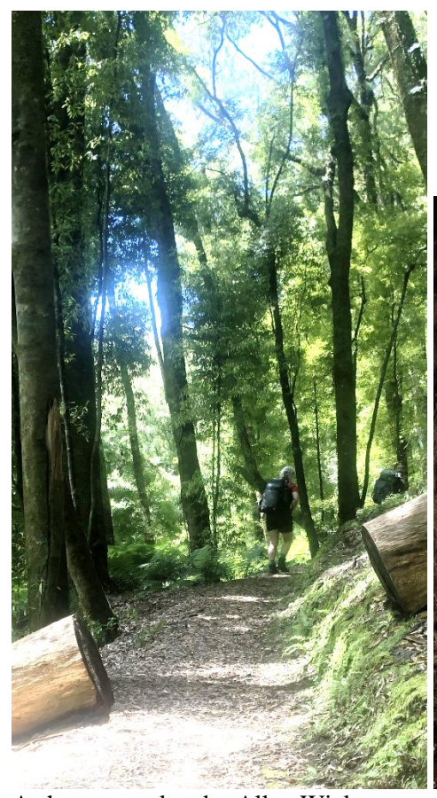
A shortcut taken by Allan Wickens

Over the next few bulletins there will be a selection of photos that were entered in our competition. Some will even become cover pictures!