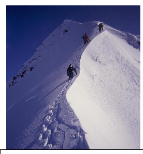
Homegrown alpine climbing Allan Wickens