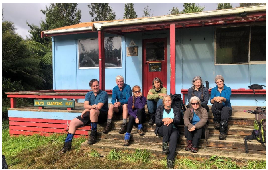
It hasn't been wet every day this year!