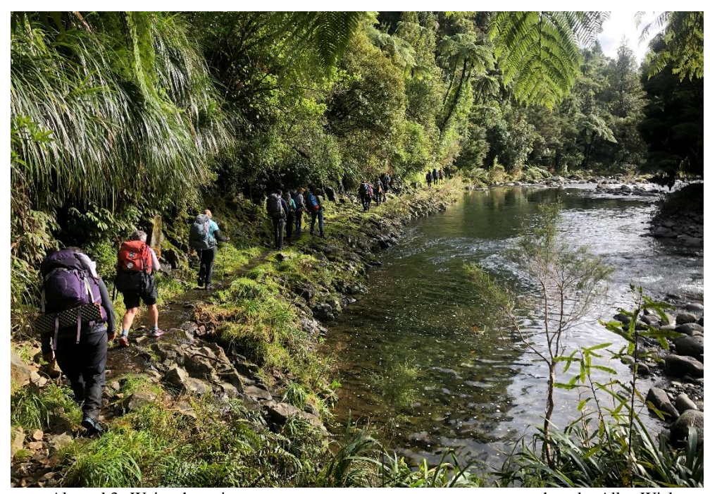
Along th3e Waitawheta river

On a sparkling blue morning a mottly group of trampers left Hamilton on the way to Waitawheta Hut (with not so much as a coffee on the way.... !!!) Set off from Franklin road car park, following the beautiful Waitawheta River. Several swing bridges on the way, when crossing, gave great views of the surrounding hills, bush and river. Traversing the river twice, everyone got wet feet.