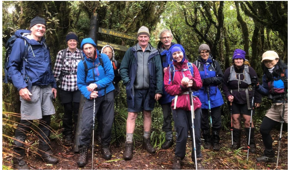
The 'clean' picture

Hihikiwi track and headed up this old volcanic dome.