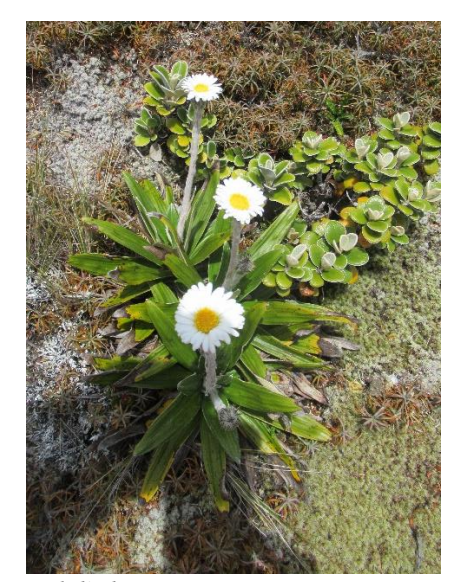
Ruapehu summer delights