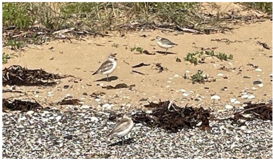
Dotterels on Ladys' bay beach