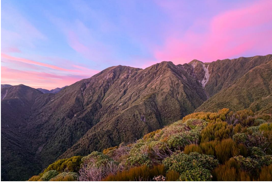
Untitled by Kat Rowe