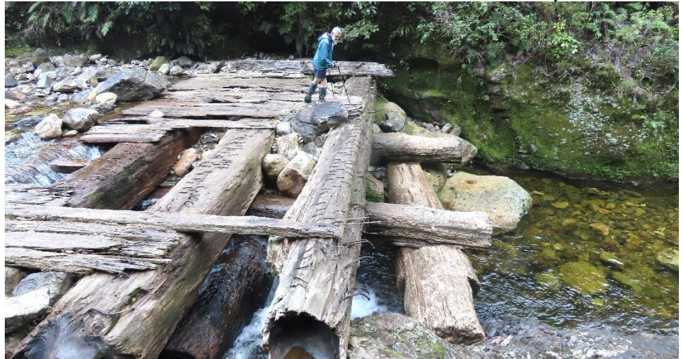
Matters on a grand scale