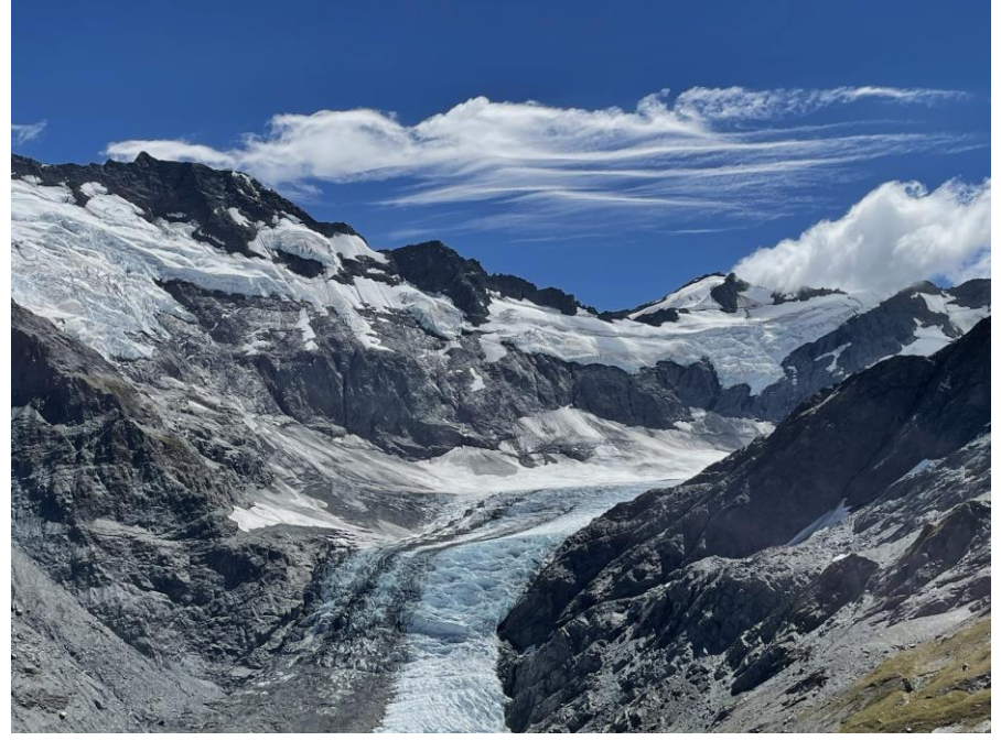
Untitled by Lynette Morris