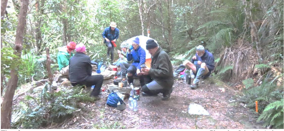
Time for sustenance

So then the fun began. It's not a difficult track from the junction close to the Pinnacles hut down to the river, but the clay was a slippery as a greased piglet and keeping one's footing was a challenge. The bush was best described as a bit low and scruffy, some of which could be caused by the line of pylons we were close to. There was some scenic viewing of the hills and valleys before descending to the river bank and the camp. It was "cosy" or "cramped" but we all fitted the available flat spots and there was a nice cooking spot above the river. An interesting variety of tipple came out for the evening chat - no campfire.