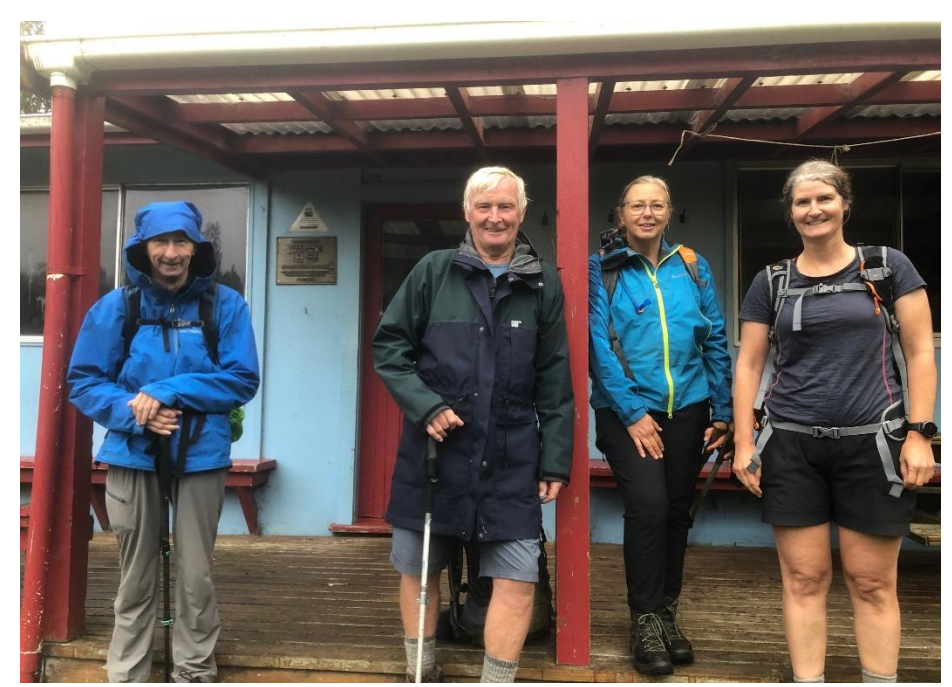
Checking out the huts in the Karangahake valley