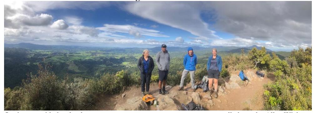
On the top with the clouds

Starting at 9.45 we crossed the new and substantial swing-bridge (2020) and climbed gently through nikau forest, before traversing the mainly level benched track high above the Waitawheta gorge. We counted about 5 small mine entrances on the way. On reaching the main track there was a short walk uphill to the unmarked and more direct route up Karangahake. This track is shown on Topomaps as starting at 290 metres and climbing up to the 520-metre contour, coming out east of the translating station. For the uninitiated, the track starts when a small grassy area is reached on the main track, on the left, followed by an incursion into low scrub with some gorse.