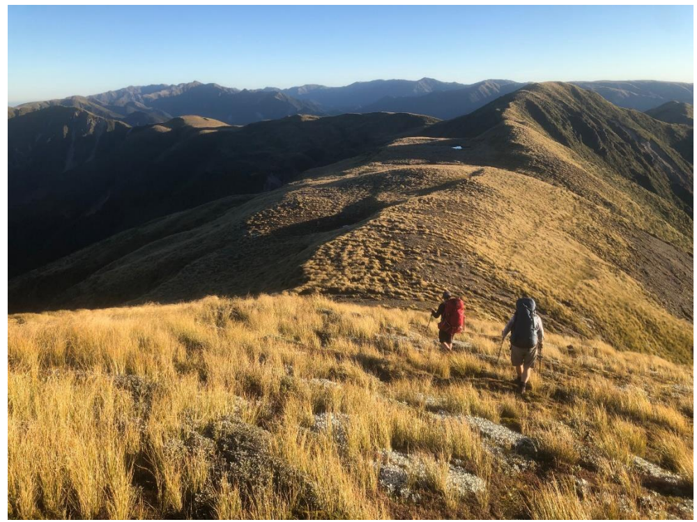
The tarn campsite in the distance

down the leeward side of the range. During the climb up Colenso Spur the day before, Dawn said she was glad we were going up and not down it. Sorry Dawn, but there we were. The section from Colenso Spur down to Barlow's Hut was not too difficult but we were pleased to arrive at the empty hut around 1.00 pm.