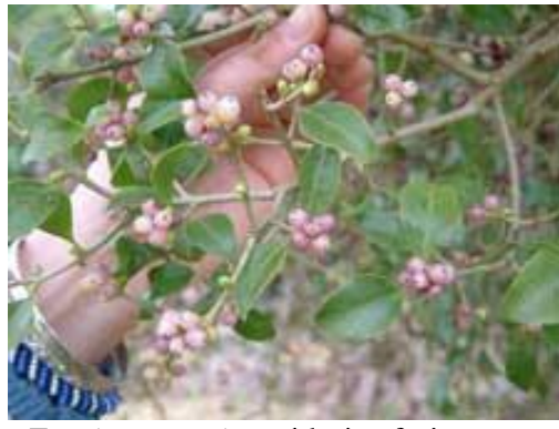
Ileostylus micranthus with fruit