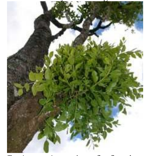
Tupeia antarctica growing on five-finger host

Beech mistletoes (known by various names including pirita) are found throughout parts of New Zealand, particularly in the South Island and are known for their masses of red or yellow-orange flowers in summer.