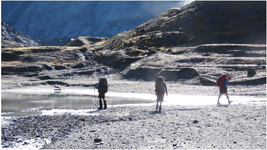
Gold miners