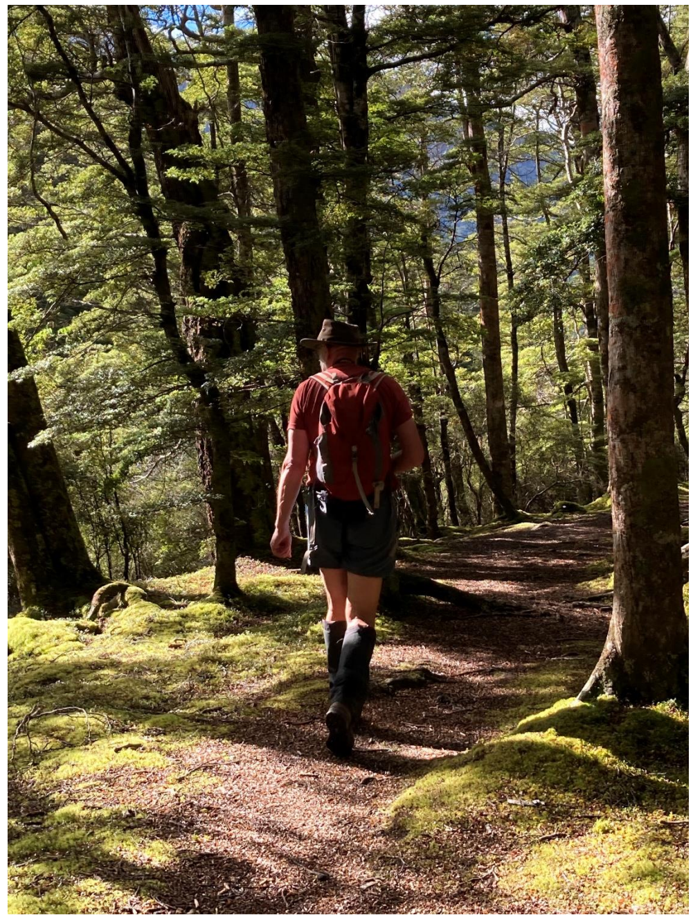
Light and Shade