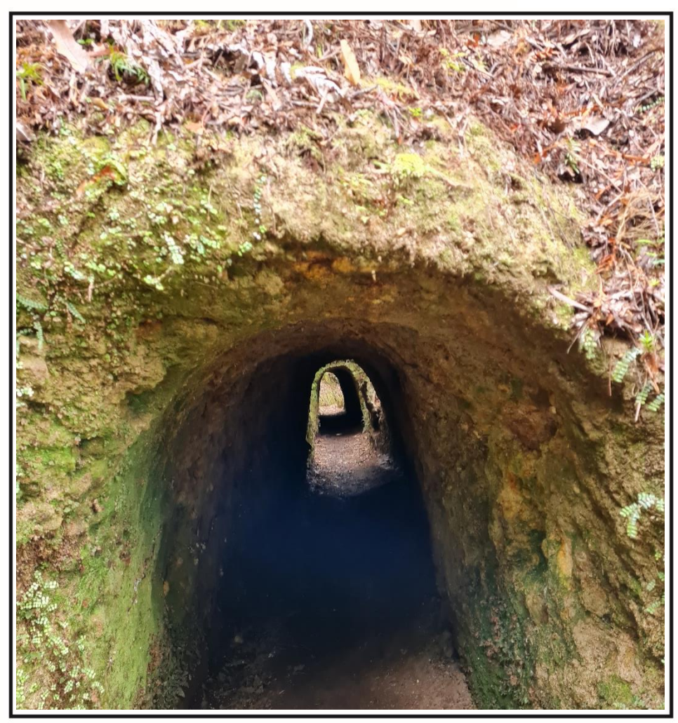
Member of: Federated Mountain Clubs of New Zealand Inc Ruapehu Mountain Clubs Association