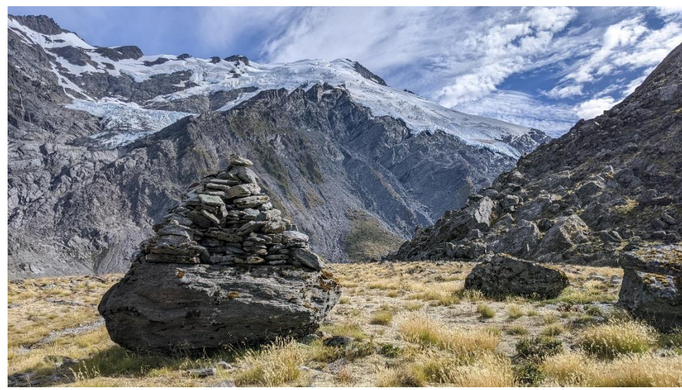
Just one more