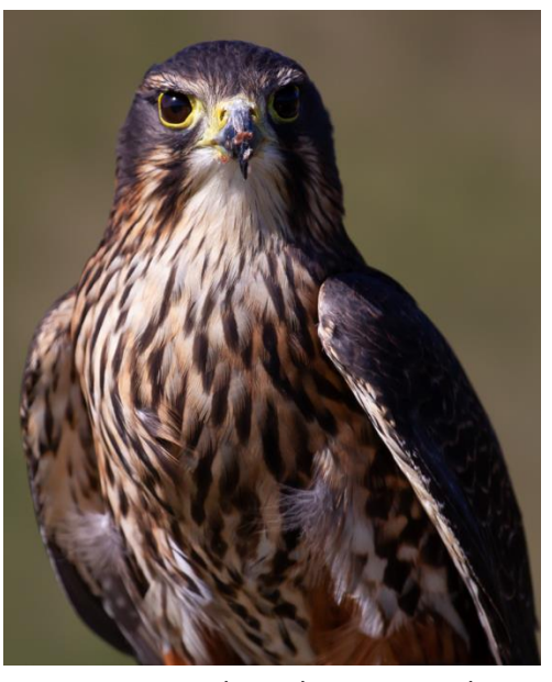
Karearea