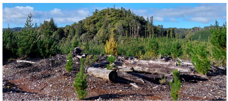
It may seem insignificant but Puketutu Pa site is still worth aiming for