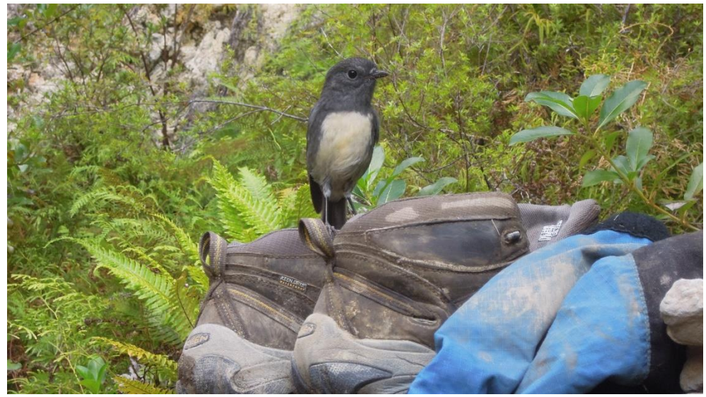
Robin on boots