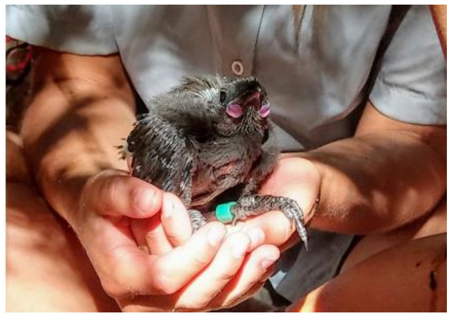
Juvenile kokako (note the pink wattles)