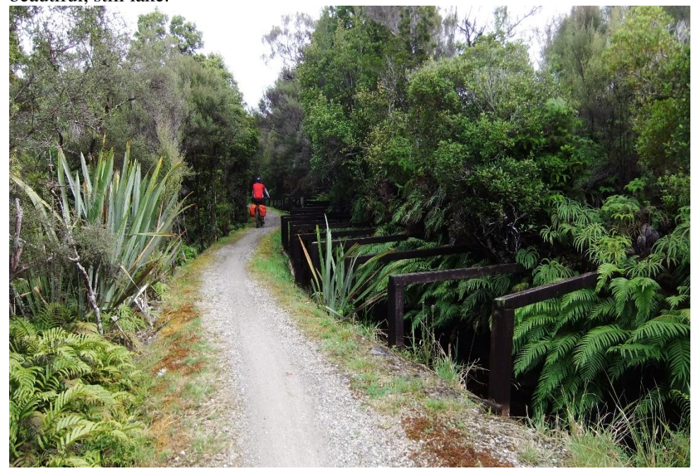
The Kaniere water race

From the end of the 'western' town, the trail zigzagged for 4km downhill to the Arahura River. This section had obviously been built for fun! The Arahura Valley revealed spectacular views of the mountains and lead to a toughish 1km climb out of the valley, through native forest, to descend to Lake Kaniere. A side-trip, consisting of a 15-minute walk to the beach at Canoe Cove, revealed a beautiful, still lake.