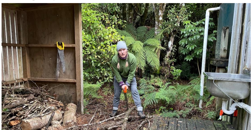
Who's the best wood chopper now?

Across the road to the beginning of the track; 9km +/-3hours to the hut. We kept to the left bank of the Waihaha river, although an easy track, there is a good rise to get the heart pumping. Crossing a swing bridge marked for one tramper at a time, it was said to be engineered for 60 elephants to cross. We behaved and crossed separately.