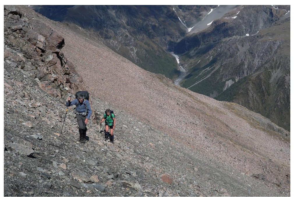
Best Picture overall: